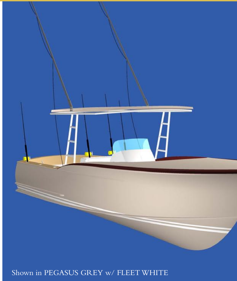
Shown in PEGASUS GREY w/ FLEET WHITE

Racor™ 10 micron primary fuel water separator