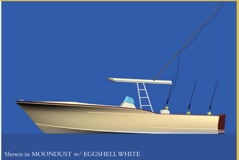
Shown in MOONDUST w/ EGGSHELL WHITE