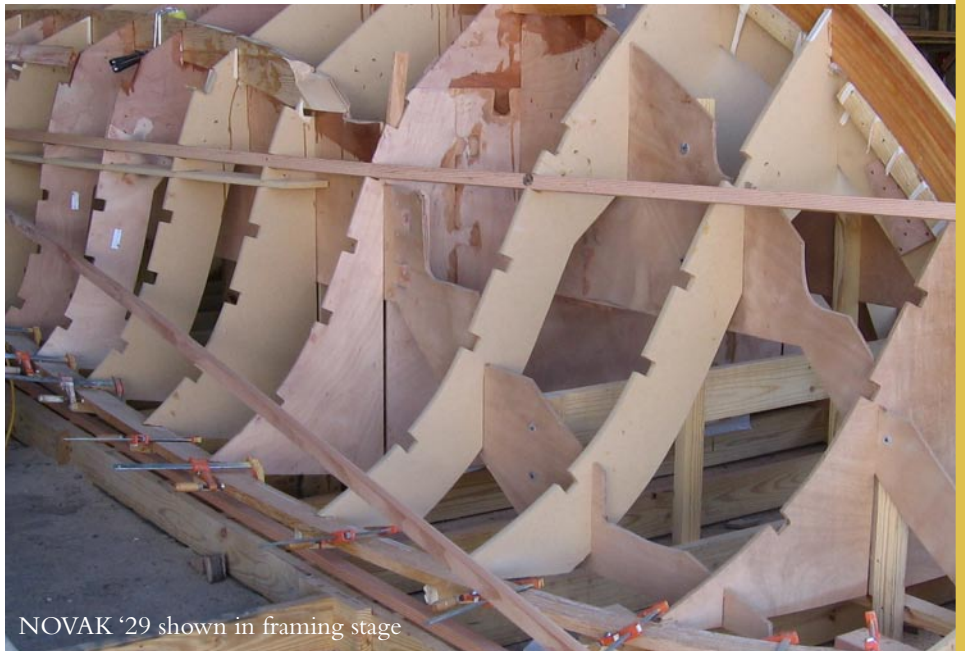
NOVAK '29 shown in framing stage