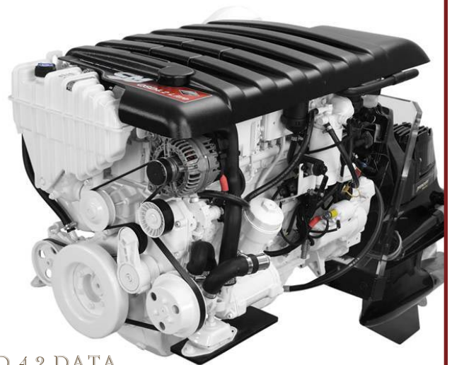
QSD 4.2 DATA

Bravo Three X sterndrive with counter-rotating stainless steel props Weight - 564 lb.